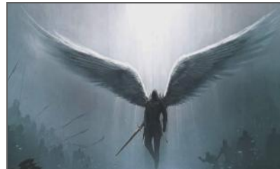
Saints Michael, Gabriel and Raphael, Feast Day Sept. 29