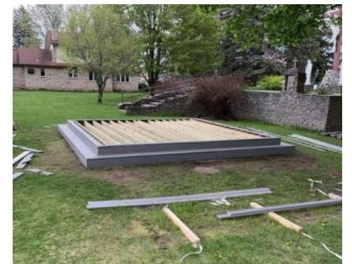
Outdoor Altar is Coming Along!

For the bulletin online, go to the Shrine website— olwshrine.org —and click on "Our Parish." You can also access it at: diocesefogaylord.org , 'Find a Parish', then find us on the map or list—click on our website.